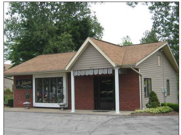
1,000 sq. ft. Office / Retail Space Stand-Alone