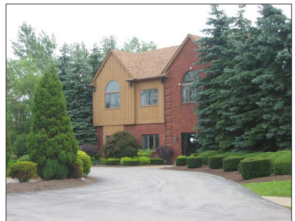
3,000 sq. ft. Office Space on Second Floor