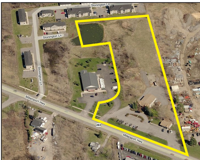
Build-to-Suit Development Opportunity 18,000 - 20,000 sq. ft.

Contact: Vito Picone at (716) 829-1970 www.McGUIREDEVELOPMENT.com