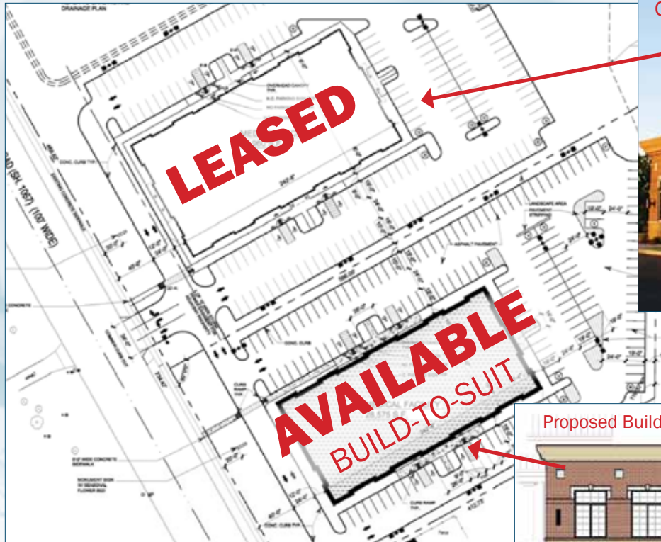
Omni Pain & Wellness Center Currently on Campus